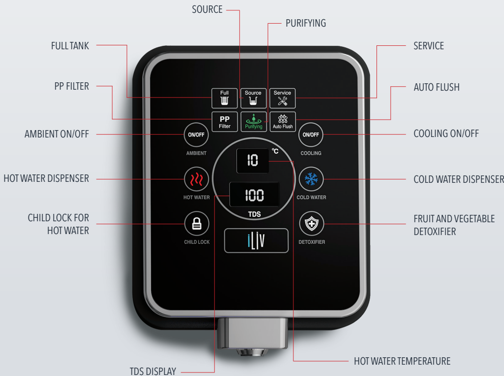
WALL MOUNT CONTROL PANEL